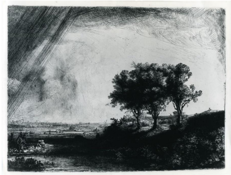
Rembrandt Harmensz van Rijn, also known as Rembrandt (1606 – 1669) Paysage aux trois arbres (The Three Trees), 1643

From Dürer's Adam and Eve in 1504 to the present day, the first section of the exhibition covers more than five centuries of creation by showing painted, drawn and engraved trees by the greatest names in the history of art: Rembrandt, Daubigny, Corot, Cézanne, Giacometti rub shoulders with Alexandre Hollan and Farhad Ostovani.